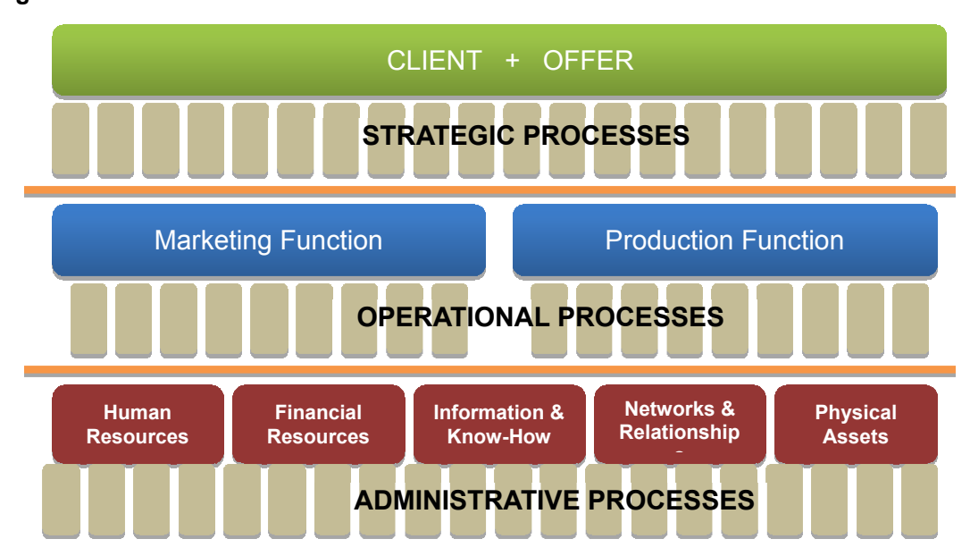
Figure 1: The business

In this guide we will be covering operational and administrative processes. For an understanding of strategic processes please refer to ITC's technical paper, Business Strategy Cycle .<sup>3</sup>