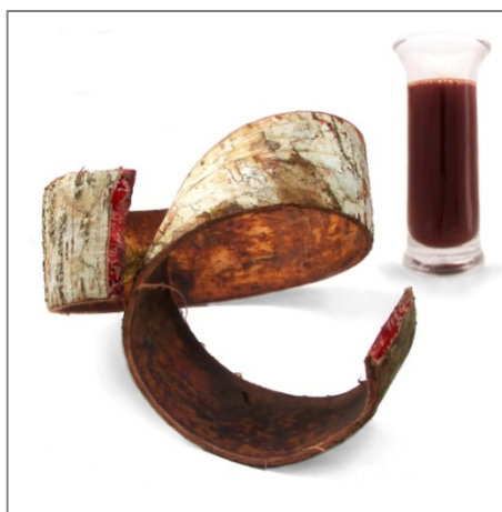
Croton lechleri