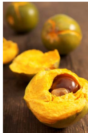
Lucuma, source: MANCHAMANTELES/PromPerú.