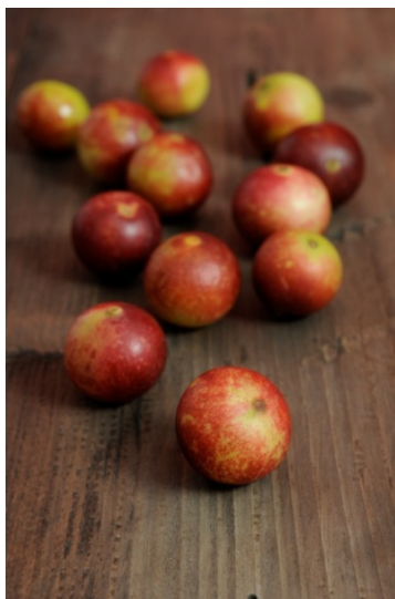
Camu camu fruit, source: MANCHAMANTELES/PromPerú.