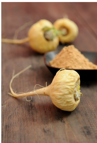
Maca, source: MANCHAMANTELES /PromPerú.

Chia ( Salvia hispanica ) – The primary interest for chia seed is for its content of omega-3 fatty acids. Chia may find a place in the North American markets for its use as a super food (as the seeds or oil), functional food and dietary supplement (for its omega-3 fatty acid content), and the oil may find a role in cosmetics.