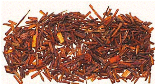
Rooibos, source: http://www.food-info.net/uk/qa/qa-fp118.htm .

Rooibos ( Aspalathus linearis N.L. BURM) is a flowering shrub belonging to the Fabaceae family and is indigenous to the mountains of South Africa's northern and Western Cape. 39 It is a polymorphic species and various wild forms exist with characteristic morphology and distribution. Rooibos is commonly consumed as a tea with rising international demand, partly attributed to its health properties. 40 It has no caffeine, little tannin, and high levels of polyphenol antioxidants. Today, rooibos is mainly cultivated on large farms and it is estimated that small-scale farmers produce around 2% of the total output. The demand for rooibos tea by the international market has increased to such a level that it now exceeds local market demand. 41 Cultivation practices have evolved significantly but many of the processing techniques continue to follow traditional methods.