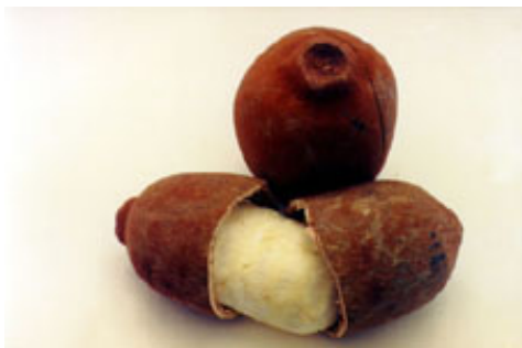
Cupuaçu, source: http://seekingsustenance.wordpress.com/2010/03/07/bacuri-cupuacu .