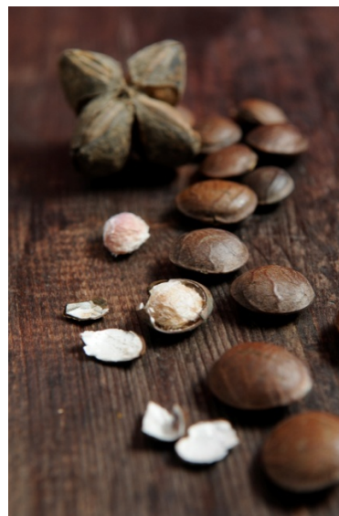
Sacha inchi, source: MANCHAMANTELES /PromPerú.