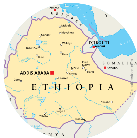
Ethiopia's export and import trends, in USD million

Due to its large population, Ethiopia has the potential to be among Africa's biggest domestic markets. The country's proximity to the Middle East presents further prospective market opportunity. Furthermore, due to its location in the horn of Africa, Ethiopia enjoys a strategic location to connect Africa, Europe, the Middle East and Asia.