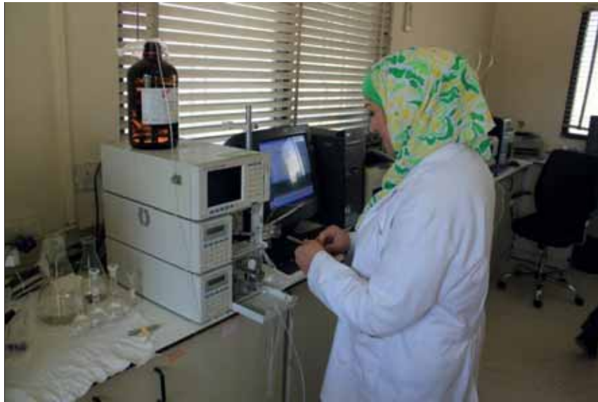
The Plant Protection and Phytosanitary Department 2

In accordance to Law No. 44 for the year 2002, the Plant Protection and Phytosanitary Department is responsible for issuance, review and enforcement of phytosanitary measures related to plants (seeds, seedlings, tubers, bulbs, trees, forest trees, herbs, flowers, leaves) and all other parts and any material of plant origin that retains its vegetal nature till consumption, in order to protect the plant health in Jordan against the risks resulting from entry of pests, diseases or organisms that carry or cause diseases, or their spreading, and to prevent or mitigate these risks and any other damages resulting from the entry or spread of pests in Jordan.