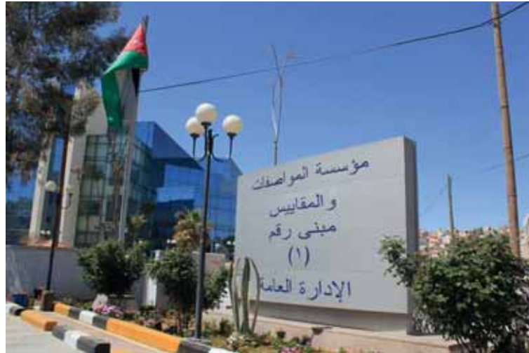
Headquarters of Jordan Standards and Metrology Organization (JSMO)