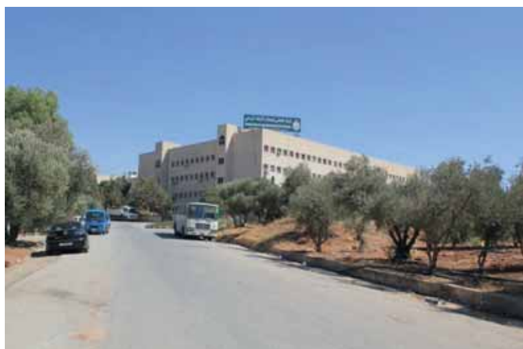
Headquarters of the National Center for Agricultural Research and Extension (NCARE)