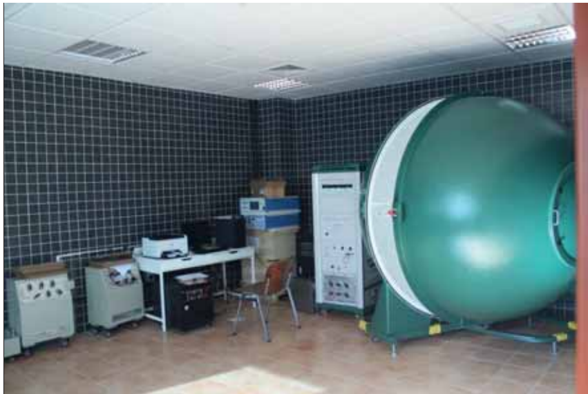
Energy Efficiency Laboratories for lights at JSMO