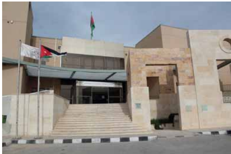
Headquarters of Jordan Food and Drug Administration (JFDA)