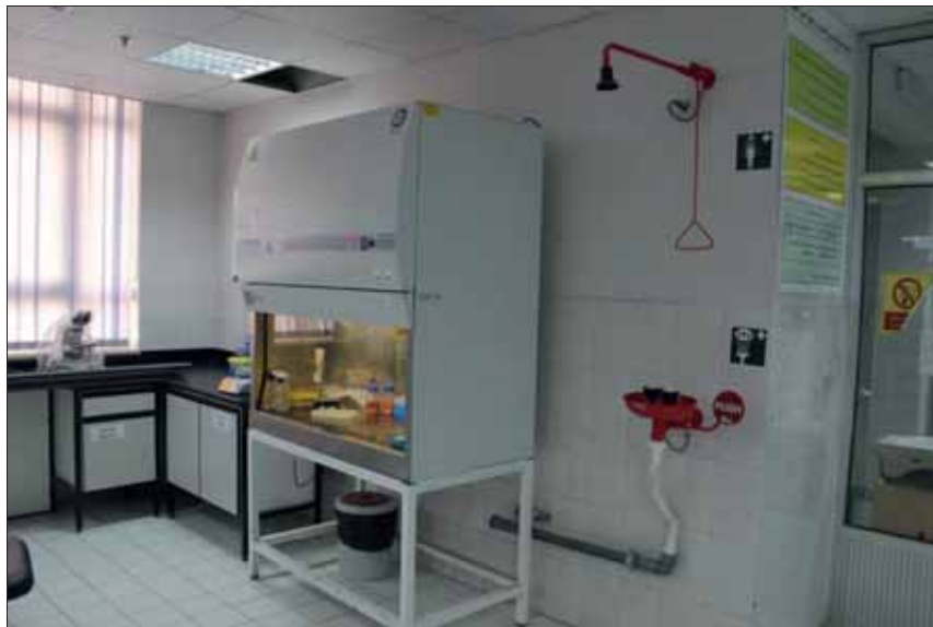
Food Microbiology Laboratories at JFDA