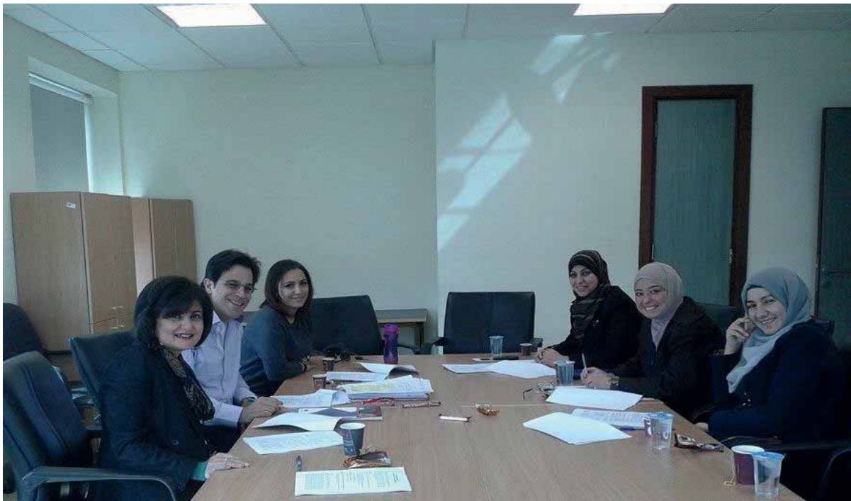
Team members of the national working group

Legal metrology activities performed in Jordan are for the purpose of protection of the consumers' rights as well as their health and safety, while calibration services provided by private and public laboratories are to ensure that measuring equipment are giving reliable results. Third party private and public certification bodies certify products or systems to give confidence to the customers and market surveillance authorities that the relevant requirements are consistently met. The certification and inspection bodies as well as testing and calibration laboratories can be accredited by the Jordanian accreditation body and/or by accreditation bodies from other countries to demonstrate their competence, respecting in this regard the cross frontier policy of ILAC/IAF.