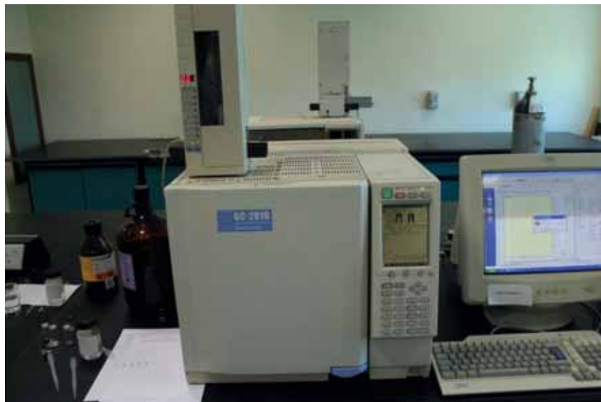
HPLC Laboratories at JSMO