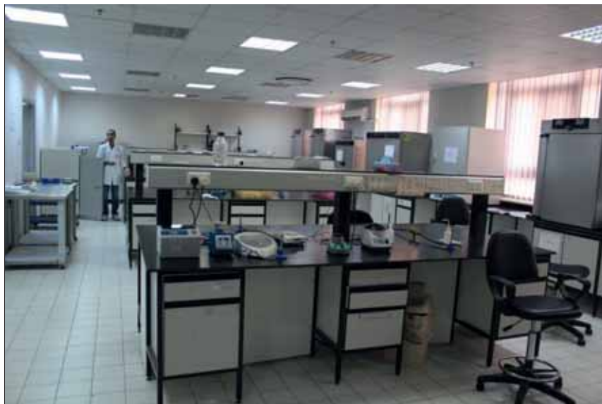
Food Microbiology Laboratories at JFDA