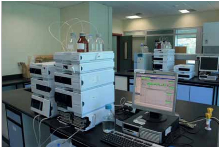
HPLC Laboratories at JSMO