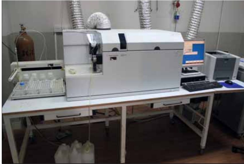
Food Chemistry Laboratories at JFDA