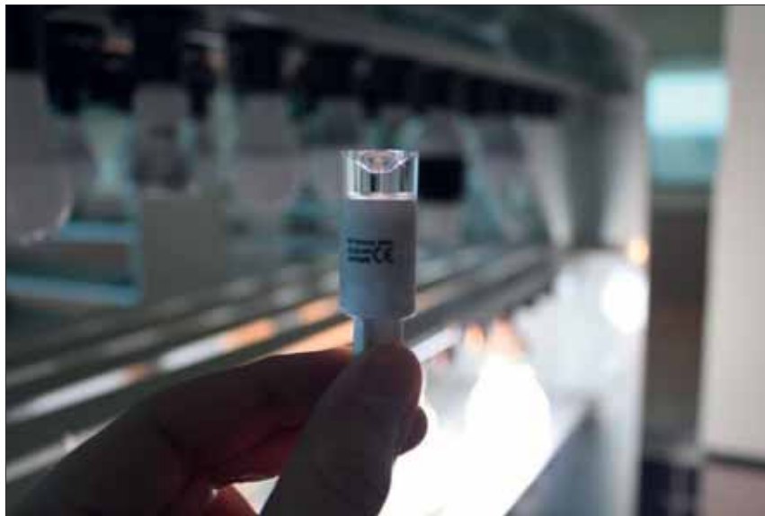
Energy Efficiency Laboratories for lights at JSMO