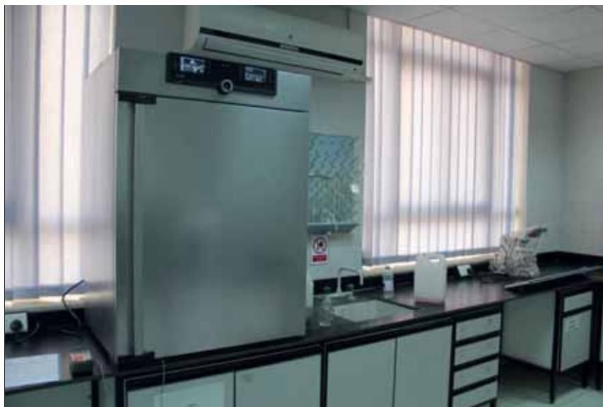
Food Microbiology Laboratories at JFDA