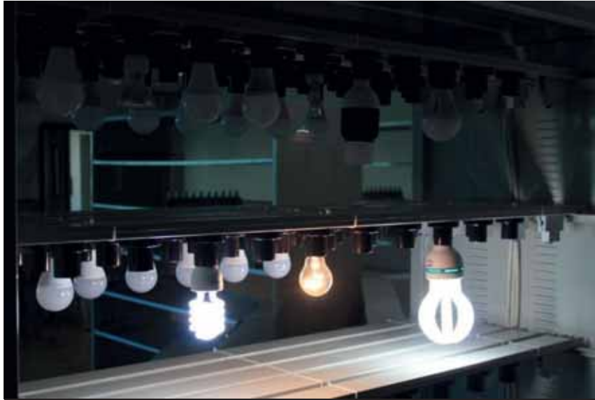
Energy Efficiency Laboratories for lights at JSMO